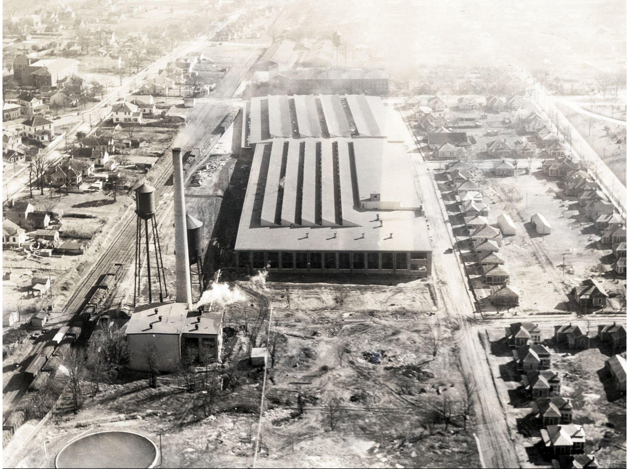
Historic Aerial, Looking South