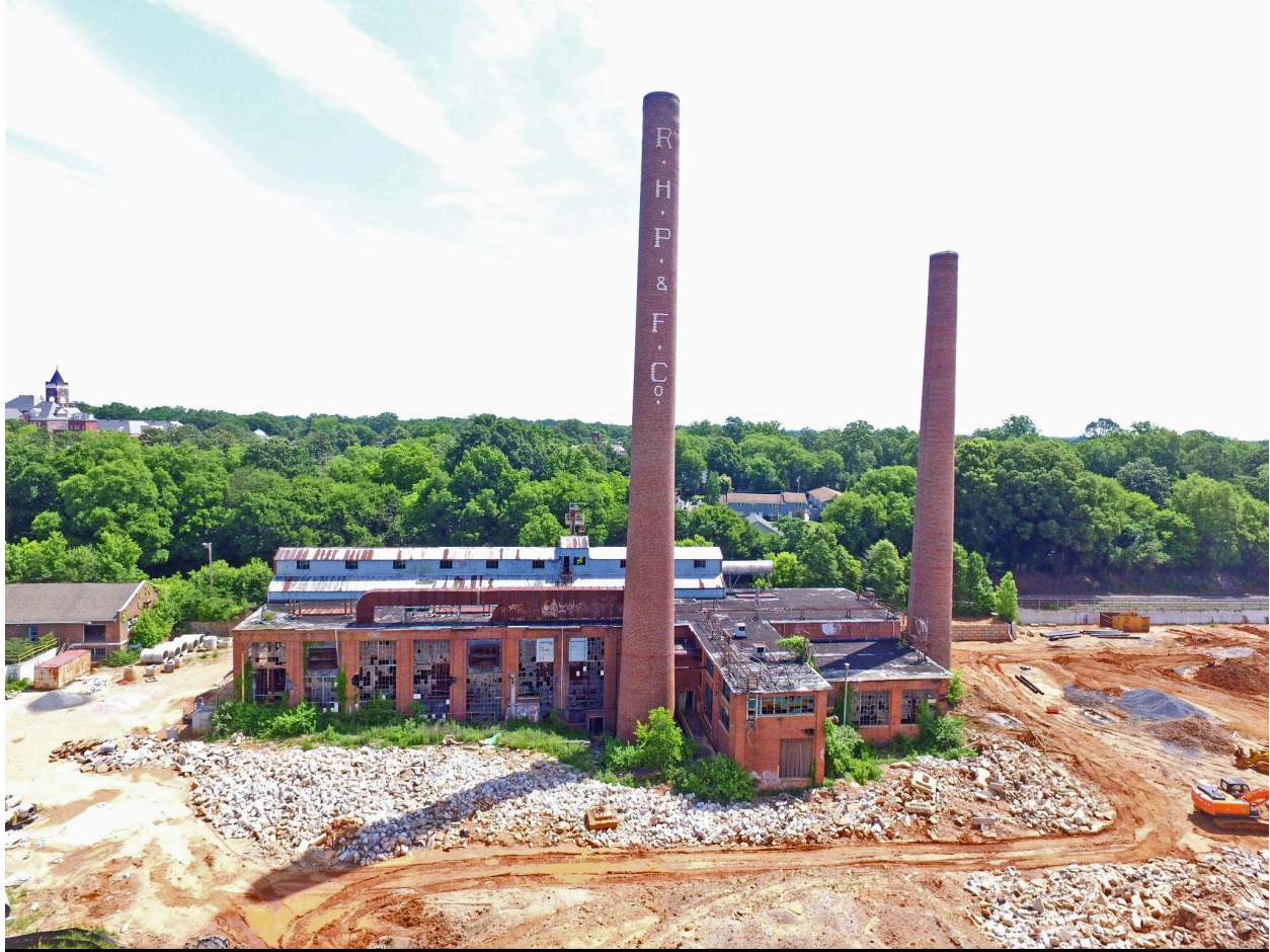
Pre-Demolition, Aerial, Looking East